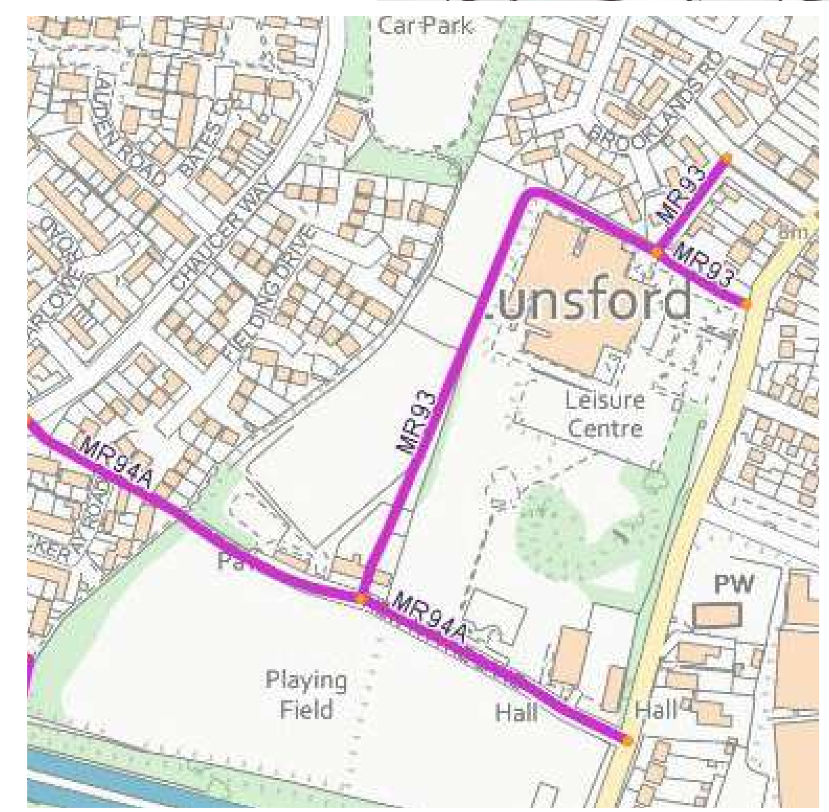
Existing Public Right of Way map

Houses address entrance and green space providing natural surveillance